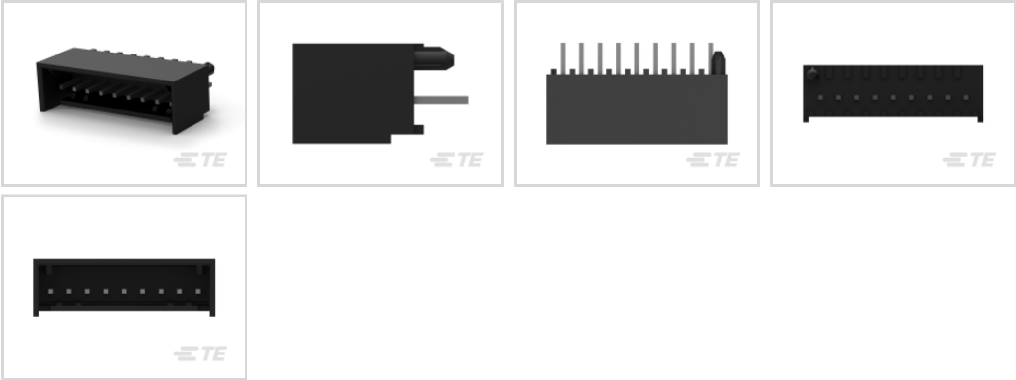
All Polyester Vertical PCB Header: 2.54mm, Shrouded, MTA 100 (37)

For compliance documentation, visit the product page on TE.com>