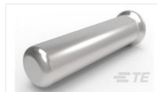
TE Part #2-332095-1 SOCKET,MIN-SPR AU SER-1