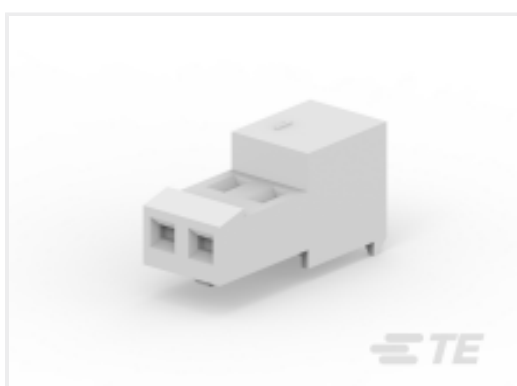
TE Part #CAT-104MTA-NTPNR MTA Receptacle: Nylon, Tin Plated, 2.54 mm