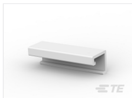
TE Part #CAT-104MTA-PLSCC Polyester PCB Connector Covers: 2.54 mm, MTA 100