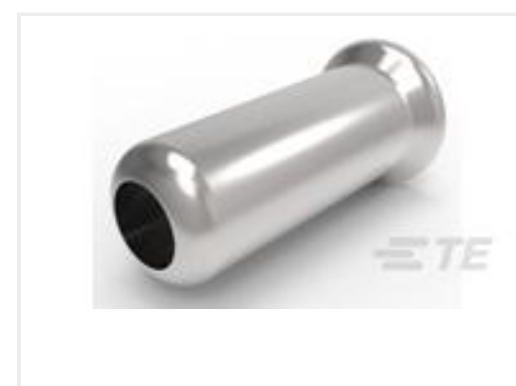
TE Part #5050871-1 SOCKET,MIN-SPR W/H SN-AU SER-5