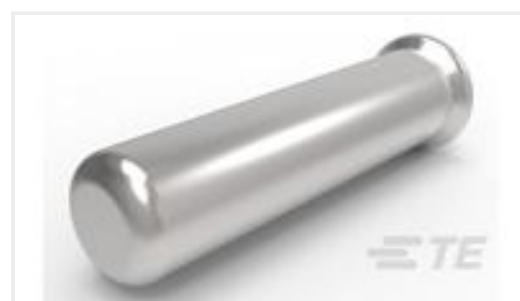
TE Part #50863-4 SOCKET,MIN-SPR AU-AU SER-2