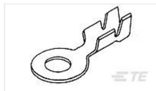
TE Part #62638-1 RING TONGUE 22-20 AWG TPBR