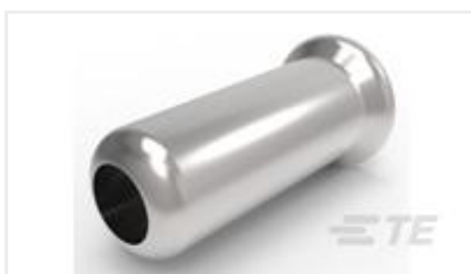
TE Part #50863 SOCKET,MIN-SPR AU-AU SER-2