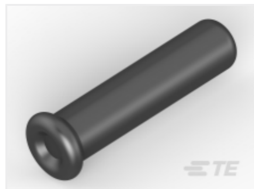
TE Part # 1-5332095-9 SOCKET,MIN-SPR W/KO SN-AU S-1