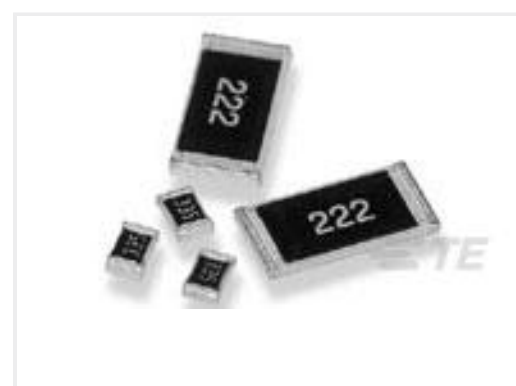
TE Part #2-1879501-9 CRGH2512 5% 15R 2W