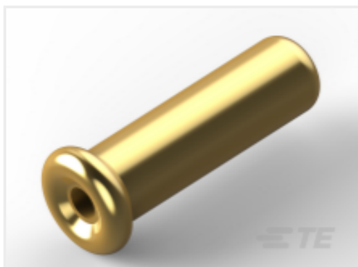
TE Part # CAT-377-MSSCB3 Mini Spring Sockets: Closed Bottom, 3A