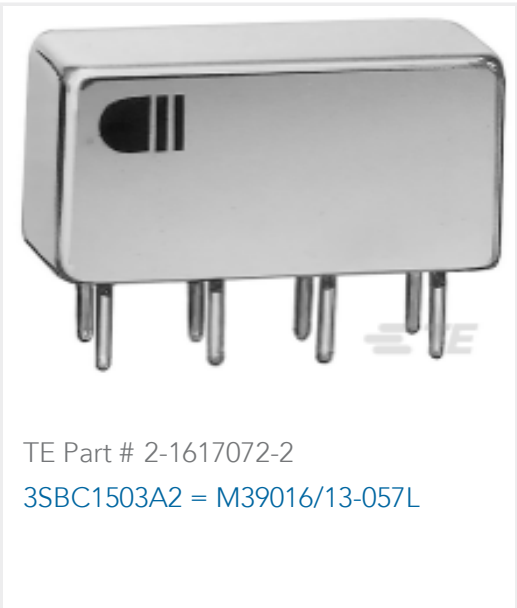
TE Part # 2-1617072-2 3SBC1503A2 = M39016/13-057L