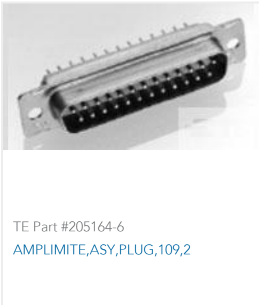
TE Part #205164-6 AMPLIMITE,ASY,PLUG,109,2