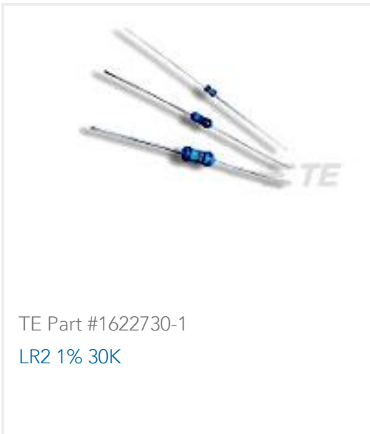
TE Part #1622730-1 LR2 1% 30K