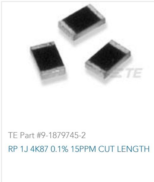
TE Part #9-1879745-2 RP 1J 4K87 0.1% 15PPM CUT LENGTH