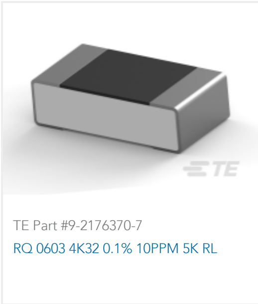
TE Part #9-2176370-7 RQ 0603 4K32 0.1% 10PPM 5K RL