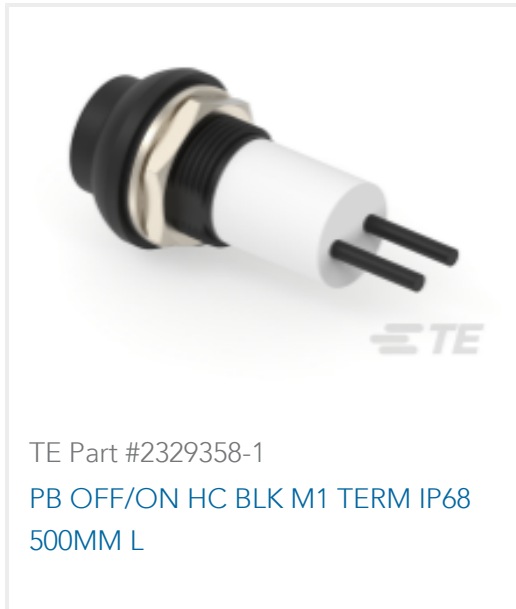
TE Part #2329358-1 PB OFF/ON HC BLK M1 TERM IP68 500MM L