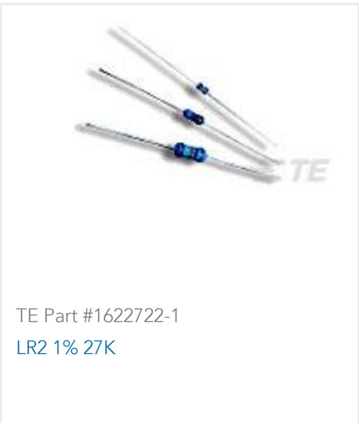
TE Part #1622722-1 LR2 1% 27K