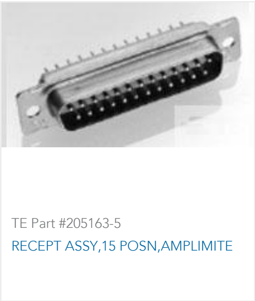
TE Part #205163-5 RECEPT ASSY,15 POSN,AMPLIMITE