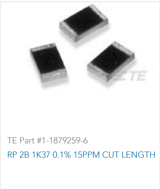
TE Part #1-1879259-6 RP 2B 1K37 0.1% 15PPM CUT LENGTH