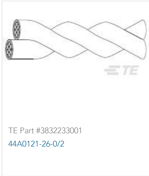
TE Part #3832233001 44A0121-26-0/2