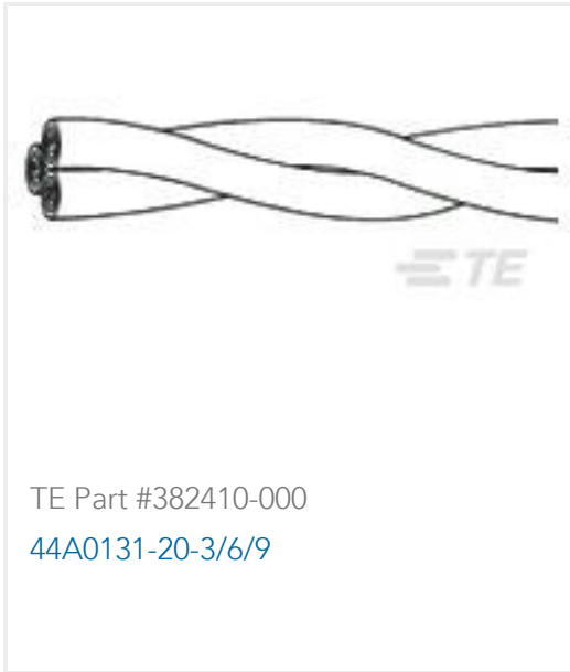
TE Part #382410-000 44A0131-20-3/6/9