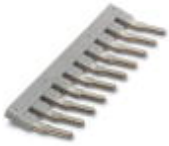
Insertion bridge, Number of positions: 10, Color: gray