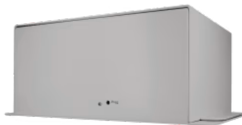
Toshiba to KNX - 16 indoor units

The Toshiba interface has been specially designed to allow bidirectional control and monitoring of Toshiba VRF systems from a KNX installation. The gateway is directly connected to the outdoor unit's communication bus and enables control of all the indoor units connected to the system.