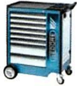
S 1500 ES-02