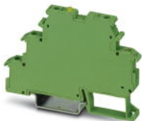
Power solid-state relay terminal block, input: 5 V DC, output: 3 - 30 V DC/3 A, terminal block width: 6.2 mm

Please be informed that the data shown in this PDF Document is generated from our Online Catalog. Please find the complete data in the user's documentation. Our General Terms of Use for Downloads are valid ( http://phoenixcontact.com/download )