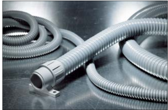
FlexiGuard FG with FG-UH fitting.