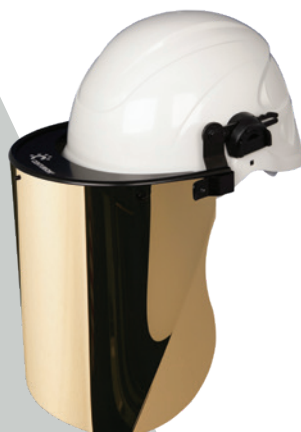
High Heat Metal Carrier with Gold Screen