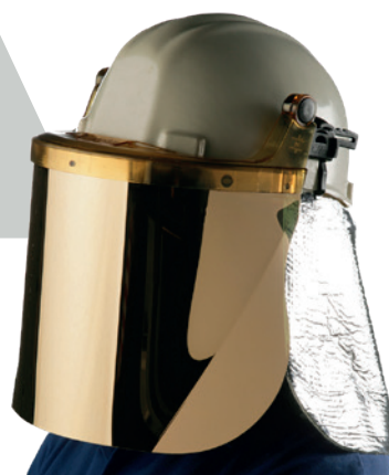
High Heat Carrier with Gold Screen and Aluminised Neck Cape