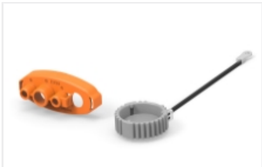
Connector Caps & Covers(3)