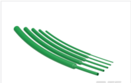
TE Part #NB13624001 RNF-100-3/8-GN-FSP