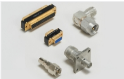
Connector Adapters & Connector Savers(8)