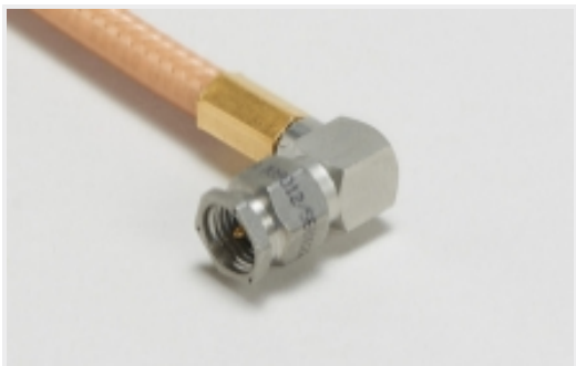
RF Cable Assemblies(2)