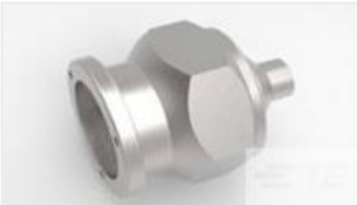
TE Part #1058694-1 3701 7941 02