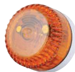
Solex Amber - White Base