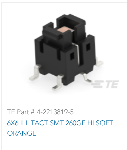
TE Part # 4-2213819-5 6X6 ILL TACT SMT 260GF HI SOFT ORANGE