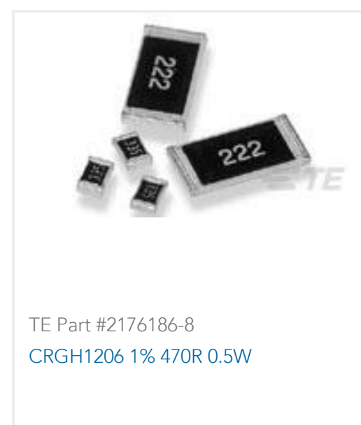
TE Part #2176186-8 CRGH1206 1% 470R 0.5W