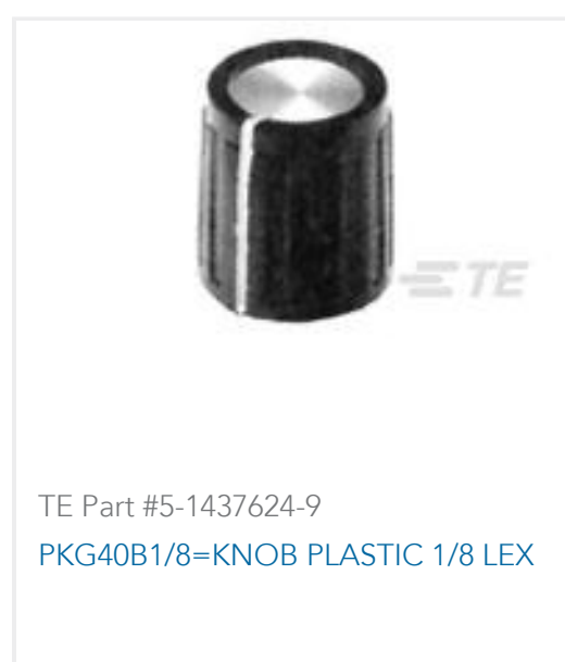
TE Part #5-1437624-9 PKG40B1/8=KNOB PLASTIC 1/8 LEX