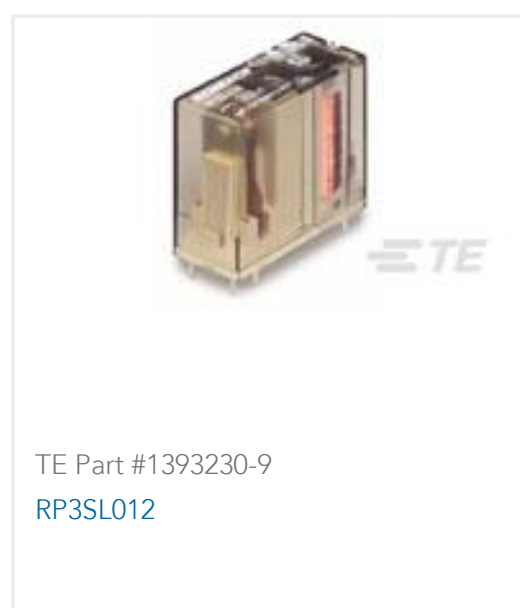
TE Part #1393230-9 RP3SL012