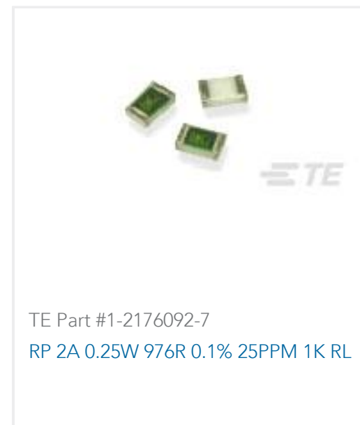
TE Part #1-2176092-7 RP 2A 0.25W 976R 0.1% 25PPM 1K RL