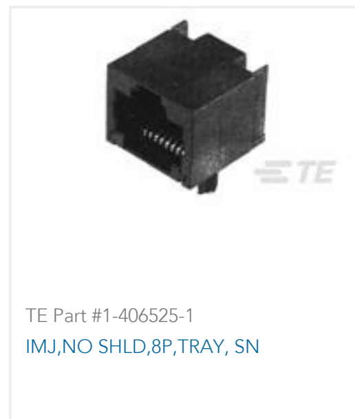
TE Part #1-406525-1 IMJ,NO SHLD,8P,TRAY, SN