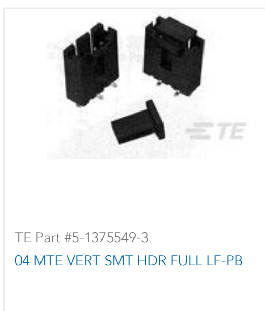
TE Part #5-1375549-3 04 MTE VERT SMT HDR FULL LF-PB