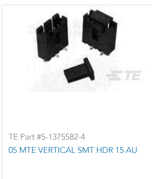
TE Part #5-1375582-4 05 MTE VERTICAL SMT HDR 15 AU