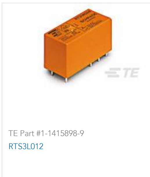
TE Part #1-1415898-9 RTS3L012