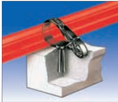
Wall plug tie in application.

Simply drill an 8 mm hole and knock in the peg. Used to fasten cables, pipes or hoses in place.