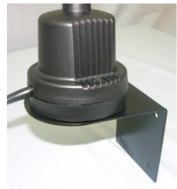
Wall Bracket Fitted to Base

EDL Lighting Limited, Redbrook lane, Brereton, Rugeley, Staffs WS15 1QU