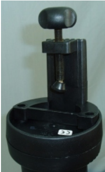
Clamp Fitted to Base