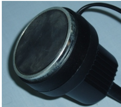
Magnet Fitted to Base