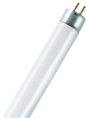
LUMILUX ® T5 short