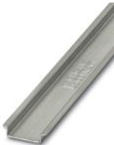
DIN rail, material: Steel, unperforated, height 7.5 mm, width 35 mm, length: 2 m

Please be informed that the data shown in this PDF Document is generated from our Online Catalog. Please find the complete data in the user's documentation. Our General Terms of Use for Downloads are valid ( http://phoenixcontact.com/download )