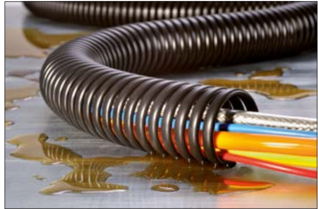
Spiral binding SPS is very robust and provides good protection against oil.