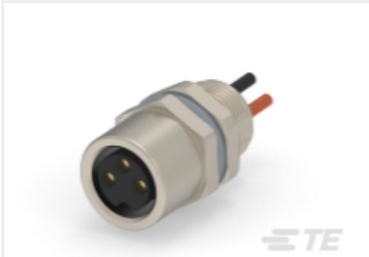
TE Part #T4073014031-001 M8.FMLE.PNLFRONT.3POS.STR WIRE