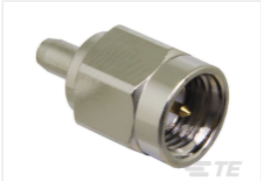
TE Part #CONSMA007-R178 SMA Plug 50 Ohm Cable Crimp