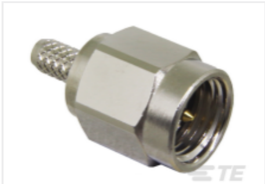
TE Part #CONSMA007 SMA Plug 50 Ohm Cable Crimp