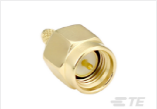
TE Part #CONSMA007-G SMA Plug 50 Ohm Cable Crimp