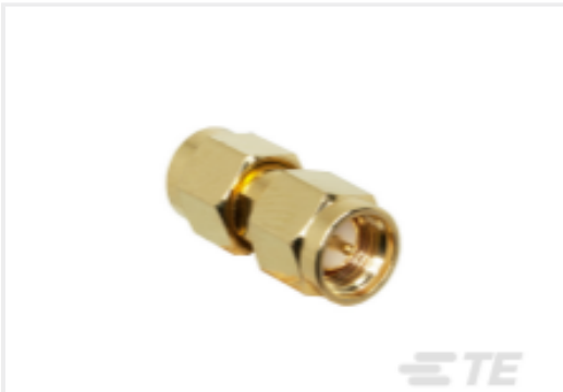
TE Part #ADP-SMAM-SMAM-G SMA Plug to SMA Plug