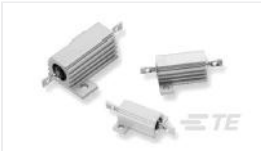
TE Part #2-1879074-3 THS15 50R 5%