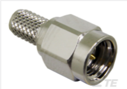
TE Part #CONSMA007-R58 SMA Plug 50 Ohm Cable Crimp