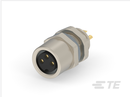
TE Part #T4033014031-000 M8.FMLE.PNLFRONT.3POS.STR