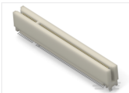
TE Part # 1761842-1 CONNECTOR ASSY, 60 DUAL POSITI