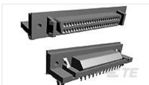
TE Part #5787082-7 68 50SR R/A RCPT ASSY,RDSN L/F