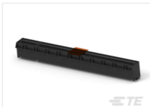
TE Part # 5-2337939-4 PCIE GEN4 CON,SMT,164POS,30u", MYLAR,HT