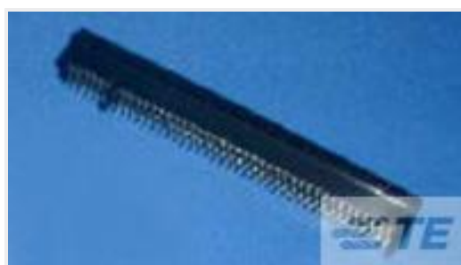
TE Part # 1734774-1 PCI EXP 3.1L 36 POS WHT G/F