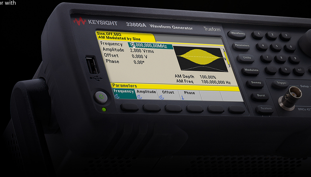
33600A Trueform Series Waveform Generator