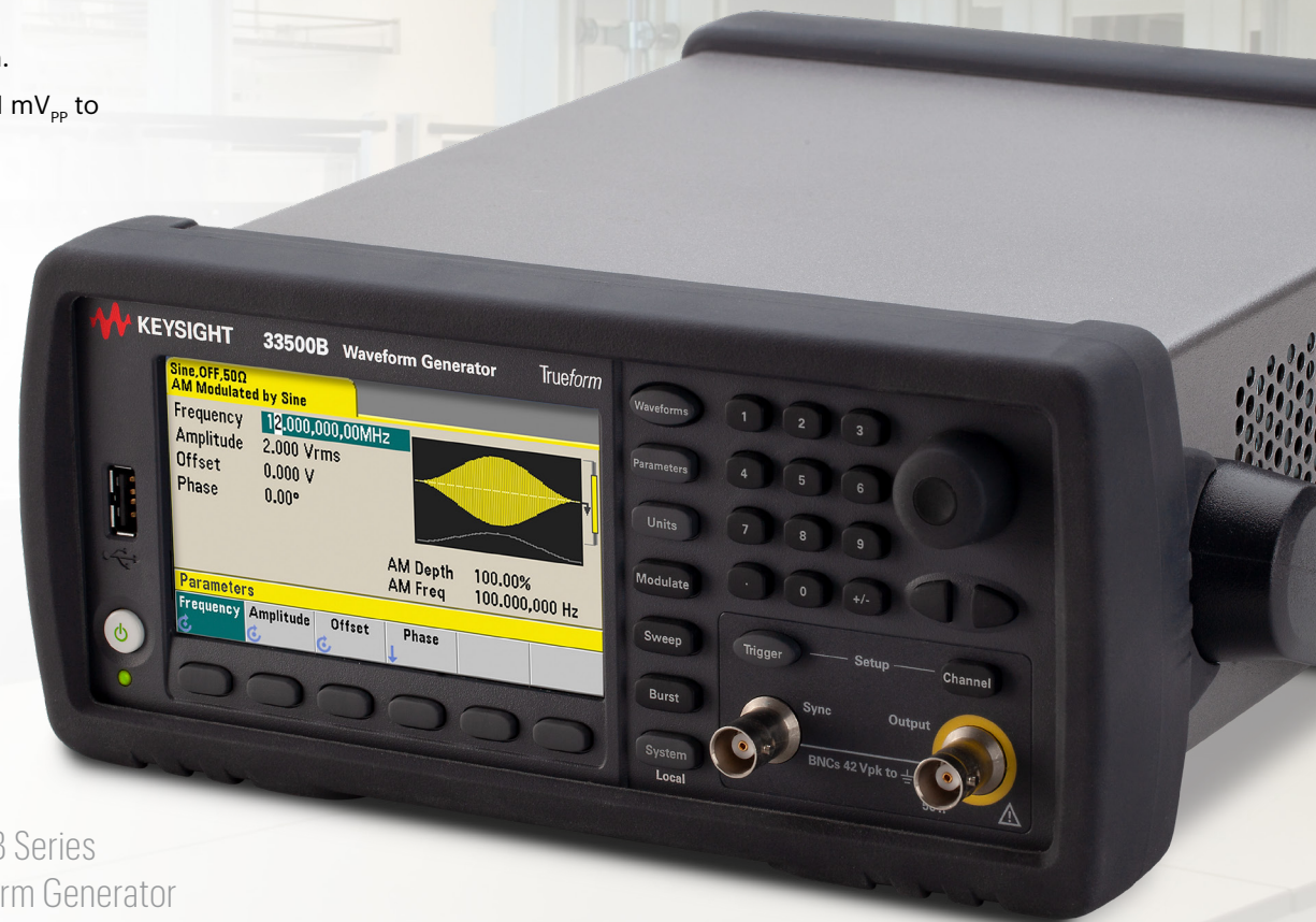
33500B Series Waveform Generator