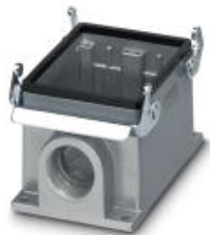
HEAVYCON box mounting base B32, with double locking latch, height 72 mm, with support 1xM32

Please be informed that the data shown in this PDF Document is generated from our Online Catalog. Please find the complete data in the user's documentation. Our General Terms of Use for Downloads are valid ( http://phoenixcontact.com/download )