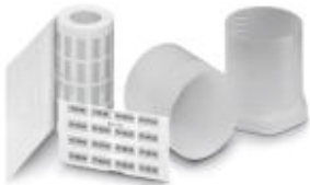
The figure shows the EML (15X9)R SR product variant

Label, Roll, silver/matt, unlabeled, can be labeled with: THERMOMARK ROLL, THERMOMARK ROLL X1, THERMOMARK X, THERMOMARK S1.1, Mounting type: Adhesive, Lettering field: 70 x 50 mm