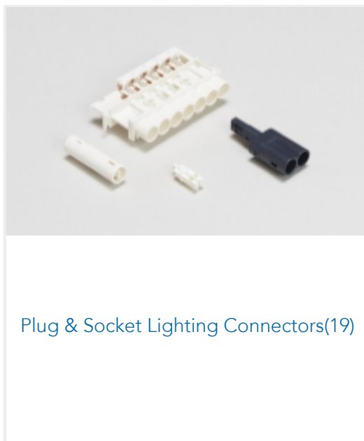
Plug & Socket Lighting Connectors(19)