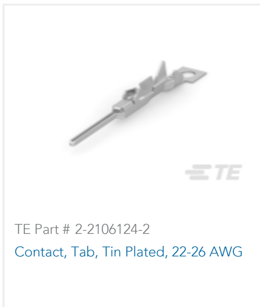
TE Part # 2-2106124-2 Contact, Tab, Tin Plated, 22-26 AWG