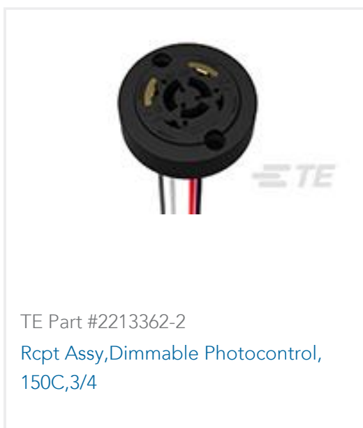
TE Part #2213362-2 Rcpt Assy,Dimmable Photocontrol, 150C,3/4