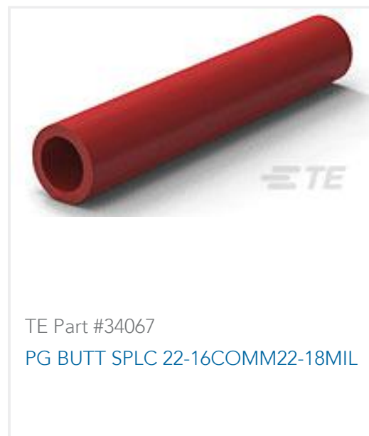
TE Part #34067 PG BUTT SPLC 22-16COMM22-18MIL