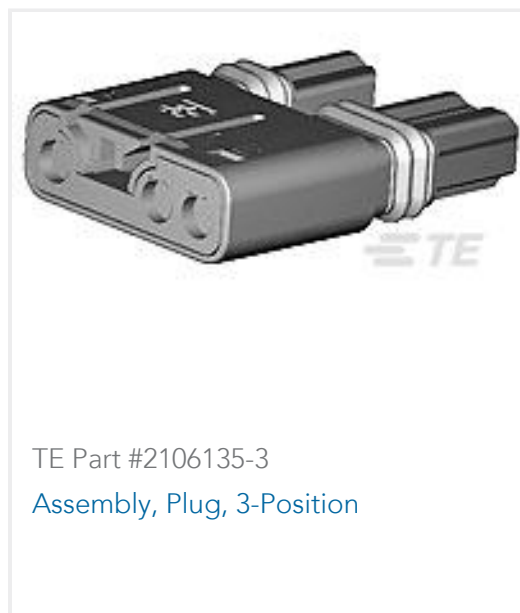
TE Part #2106135-3 Assembly, Plug, 3-Position