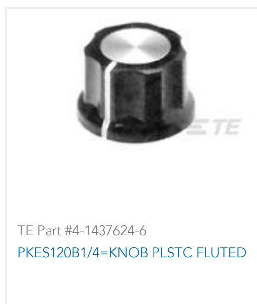
TE Part #4-1437624-6 PKES120B1/4=KNOB PLSTC FLUTED