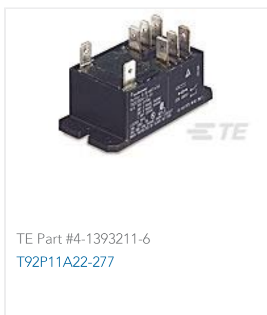
TE Part #4-1393211-6 T92P11A22-277