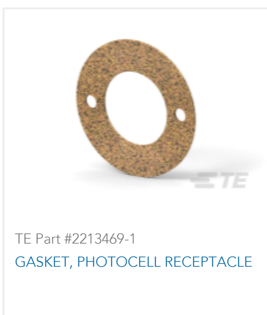
TE Part #2213469-1 GASKET, PHOTOCELL RECEPTACLE