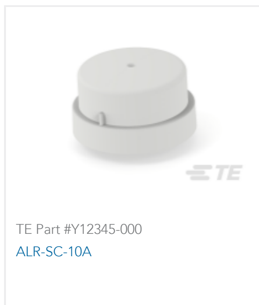
TE Part #Y12345-000 ALR-SC-10A