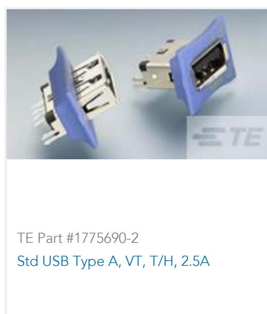
TE Part #1775690-2 Std USB Type A, VT, T/H, 2.5A