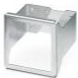
DIN rail adapter for EEM-MA600 and EEM-MA400 energy meters

DIN rail adapter - EEM-MKT-DRA - 2902078