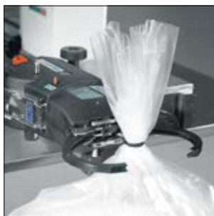
Packaging application with Bench mount kit horizontal 3080.