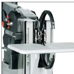
Optional: Bench mount kit 3080 with table board.