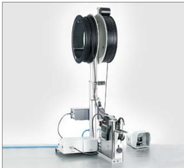
Bench mount kit 3080 with foot pedal (also shown: Autotool System 3080, Power pack 3080 and consumables).