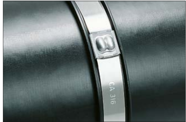
Cable tie MBTXH with LFPC Protective Channel.