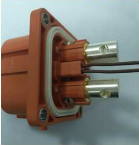
2芯插座 2 Ports Receptacle