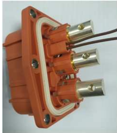
3芯插座 3Ports Receptacle