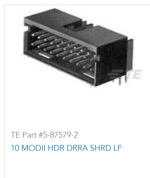
TE Part #5-87579-2 10 MODII HDR DRRRA SHRD LF