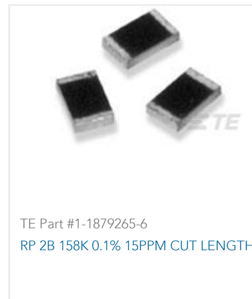
TE Part #1-1879265-6 RP 2B 158K 0.1% 15PPM CUT LENGTH