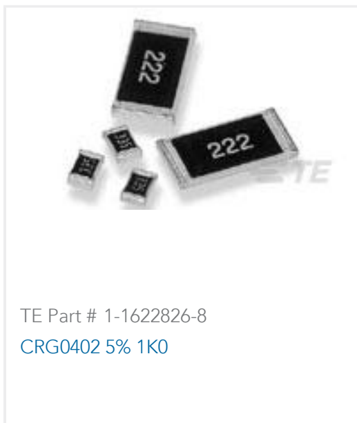
TE Part # 1-1622826-8 CRG0402 5% 1K0