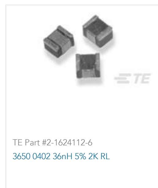
TE Part #2-1624112-6 3650 0402 36nH 5% 2K RL