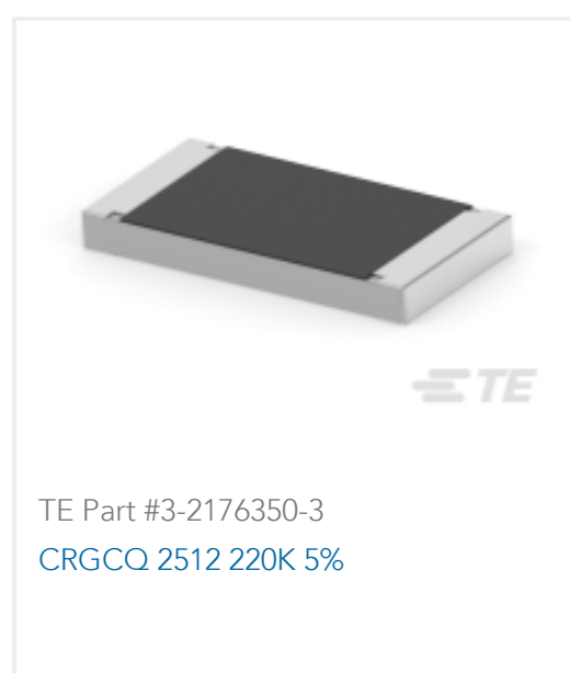
TE Part #3-2176350-3 CRGCQ 2512 220K 5%