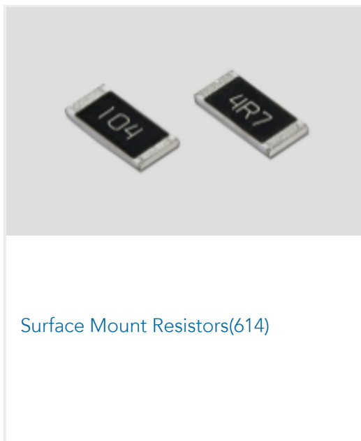
Surface Mount Resistors(614)