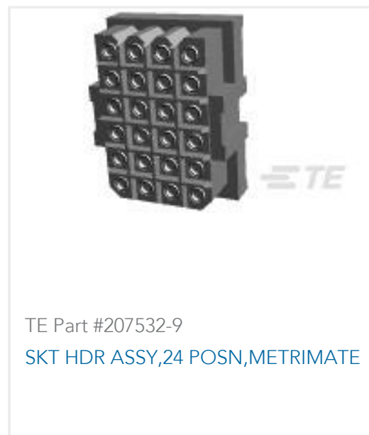
TE Part #207532-9 SKT HDR ASSY,24 POSN,METRIMATE