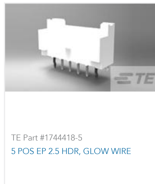
TE Part #1744418-5 5 POS EP 2.5 HDR, GLOW WIRE