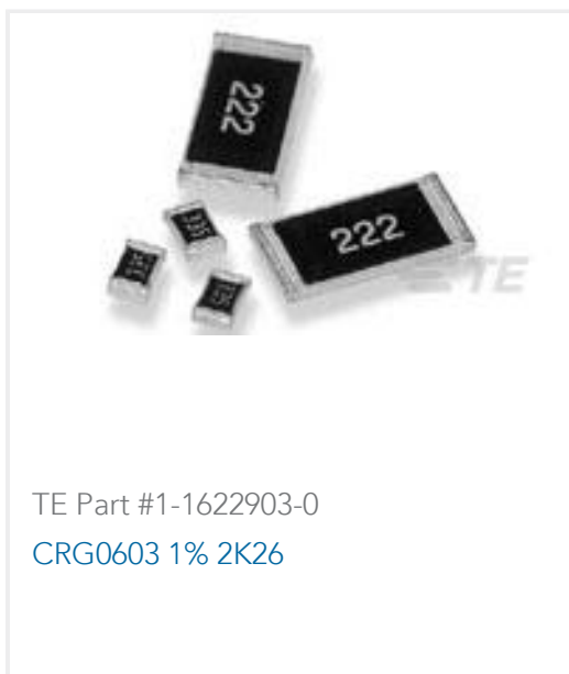
TE Part #1-1622903-0 CRG0603 1% 2K26