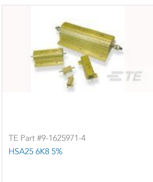
TE Part #9-1625971-4 HSA25 6K8 5%