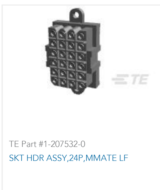
TE Part #1-207532-0 SKT HDR ASSY,24P,MMATE LF