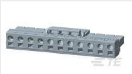
TE Part #1-2229794-2 D3950 REC 7/11POS 1ROW Y KEY MARKED