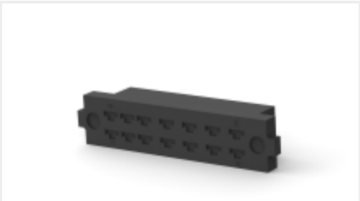
TE Part #171090-1 FF 250 REC HSG 14P NYLON