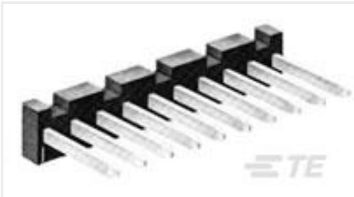
TE Part #5-87655-4 04 MODI HDR SRRA .156CL, ROHS