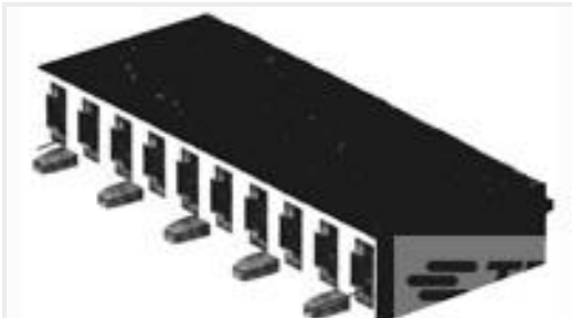
TE Part #2-87025-5 02 MODI CRMP S-I HSG SR .156CL