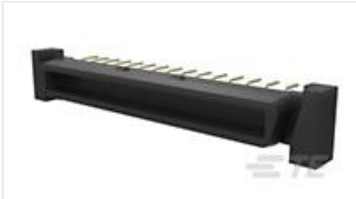
TE Part #5917629-5 AMP FH REC V 120P H-9 SIF