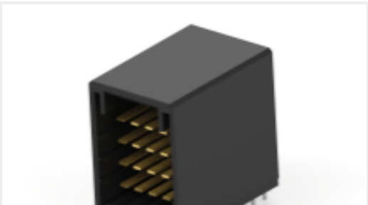
TE Part #CAT-D9934-A75H DYNAMIC 3400F HDR ASSY