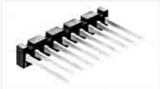
TE Part #5-87160-5 03 MODI HDR SRST .156CL, ROHS