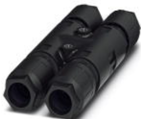
QUICKON H-distributor, black, 4+PE-pos., 2.5 mm 2 ... 6.0 mm 2 /690 V/40 A, for cable diameter of 12 mm ... 20 mm, with a sealing bolt.

Please be informed that the data shown in this PDF Document is generated from our Online Catalog. Please find the complete data in the user's documentation. Our General Terms of Use for Downloads are valid ( http://phoenixcontact.com/download )