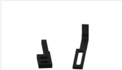
TE Part #2119533-4 STRIPPER, SIDE FEED