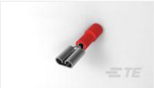
TE Part #640911-1 RECEPT,PIDG FASTON 22-18 205