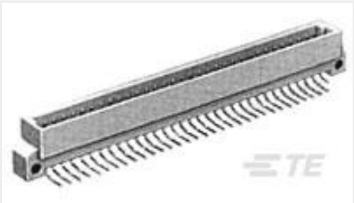
TE Part #5-1393644-6 V42254B1200B200=PC612 MESSERLE