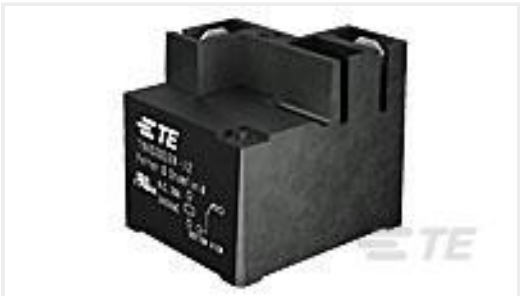
TE Part #2-1419104-1 T9AS1D22-24