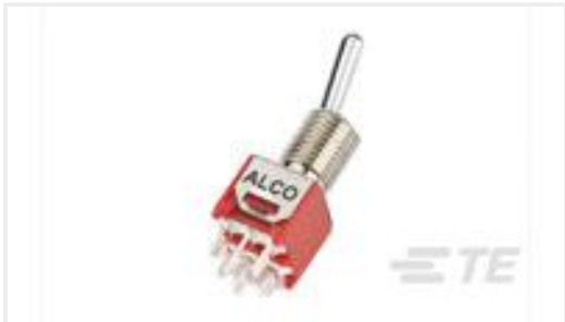
TE Part #2267079-5 TMD1T3B1M1QE