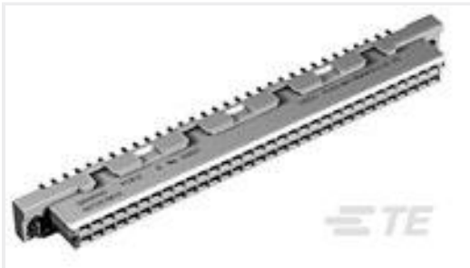
TE Part #7-1393640-2 V42254B2201B200=PC612 FEDERLEI