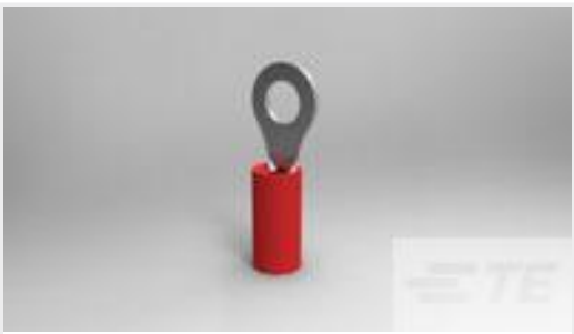
TE Part #2-31890-1 PIDG R 22-16 COMM 22-18 MIL 8