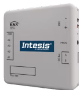
Hisense to KNX - 1 indoor unit

The Hisense-KNX interface allows full bidirectional communication between Hisense VRF systems units and KNX installations. It has four potential-free binary inputs to integrate external devices (such as window contacts or presence detectors), with the corresponding internal functions available to help improve energy efficiency.