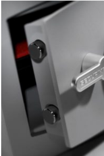
Mini Vault Bolts & Handle