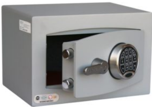
Mini Vault 0 S2 Silver Electronic Locking