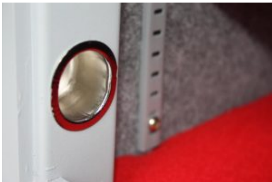
Mini Vault Chrome Bolt Cup