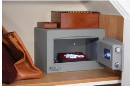
Mini Vault 0 S2