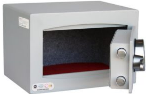
Mini Vault 0 S2 Silver Electronic Locking