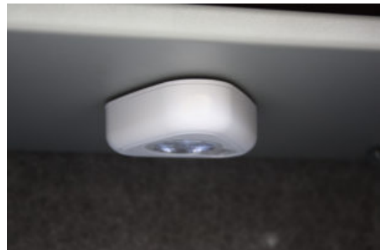
Motion Activated Magnetic Light