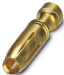
Turned 2.5 crimp contact, individual female contact, core diameter 1.5 mm 2 , gold-plated

Please be informed that the data shown in this PDF Document is generated from our Online Catalog. Please find the complete data in the user's documentation. Our General Terms of Use for Downloads are valid ( http://phoenixcontact.com/download )