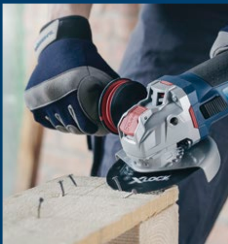
Wood with nails