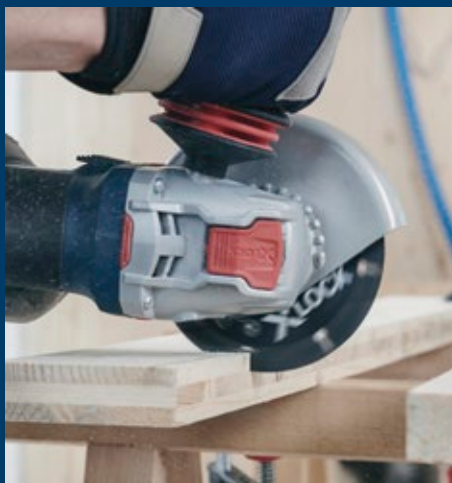
Adjustment work in wood

Make your angle grinder a universal tool.