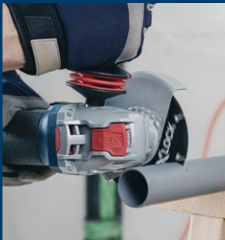
Plastics, e.g. cable ducts or plastic tubes