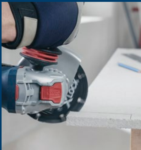
Fibre cement such as Trespa®