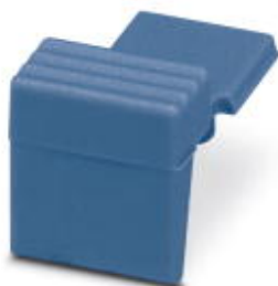
Circular connectors (cable-side), Range of articles: PRC, Accessories, color: blue

Please be informed that the data shown in this PDF Document is generated from our Online Catalog. Please find the complete data in the user's documentation. Our General Terms of Use for Downloads are valid ( http://phoenixcontact.com/download )