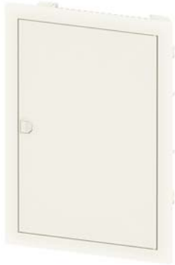
SIMBOX XL hollow wall, 2-tier 2x 12 MW (14 MW) Safety class 2