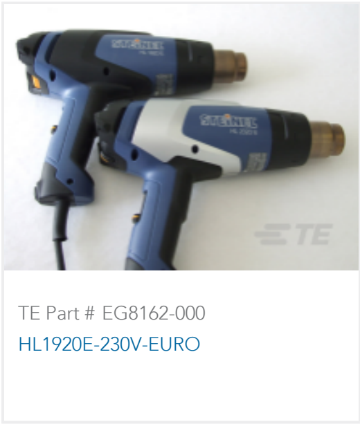
TE Part # EG8162-000 HL1920E-230V-EURO