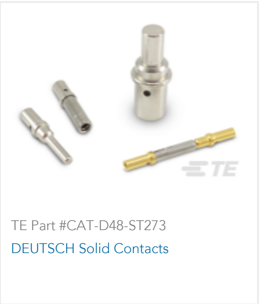
TE Part #CAT-D48-ST273 DEUTSCH Solid Contacts