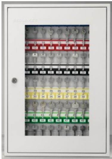
System 50 Key View