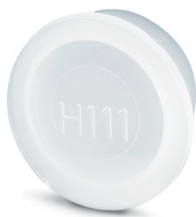
Plastic protection cap for connectors with M17 compact knurled nut and M17 compact SPEEDCON knurled nut

Please be informed that the data shown in this PDF document is generated from our online catalog. Please find the complete data in the user documentation. Our general terms of use for downloads are valid.