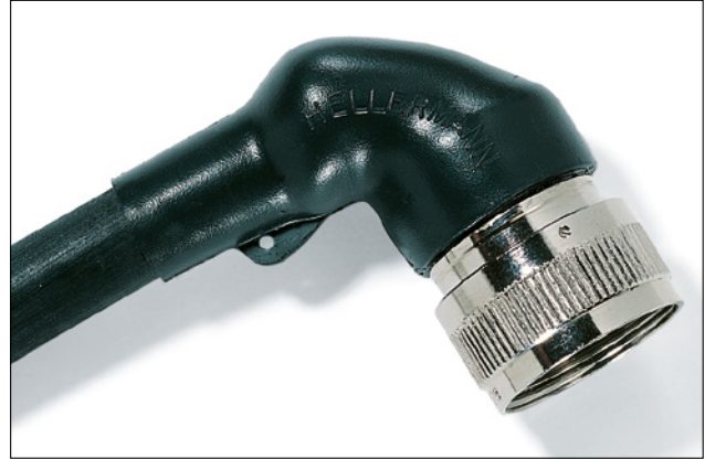
Krympeformgods 11-52-4 med konnektor.