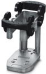
HEAVYCON plug assembly frame, lower part with double locking latch, for sleeve housing without double locking latch or HC-CIF-..HFFD.. upper part, for type B16 contact inserts, for NS35/7,5 DIN rails

Please be informed that the data shown in this PDF Document is generated from our Online Catalog. Please find the complete data in the user's documentation. Our General Terms of Use for Downloads are valid ( http://phoenixcontact.com/download )