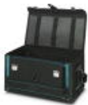
Tool case, empty, can be locked, with rubber straps to hold tools in place