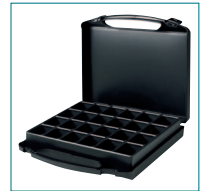
TE 24 K 6-10