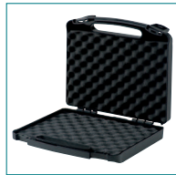
K2001 ESD Noppe