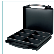
TE 6 K 1-6-10