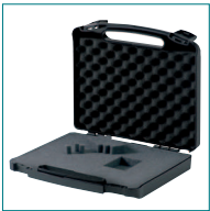
K2001 ESD Raster