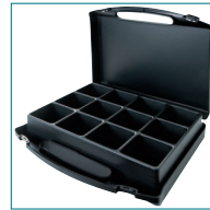
TE 12 K11-6-10