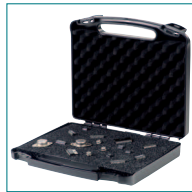
K2001 ESD Steckschaum