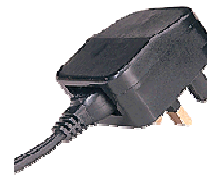
COVER SNAPS SHUT & SECURED WITH SCREW

The American standard plug adaptor is the latest converter plug from the Powerconnections range. This product also converts Japanese and Chinese plugs to BS1363.