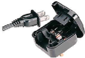
2 PIN PLUG