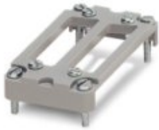
D-SUB adapter plate, for two D-SUB connectors, no. of positions 25, housing series HC-B 10...

Please be informed that the data shown in this PDF Document is generated from our Online Catalog. Please find the complete data in the user's documentation. Our General Terms of Use for Downloads are valid ( http://phoenixcontact.com/download )