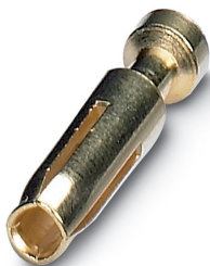
Turned 2.5 crimp contact, individual Fe female contact, core cross section 0.5 mm 2 , Au surface

Please be informed that the data shown in this PDF Document is generated from our Online Catalog. Please find the complete data in the user's documentation. Our General Terms of Use for Downloads are valid ( http://phoenixcontact.com/download )