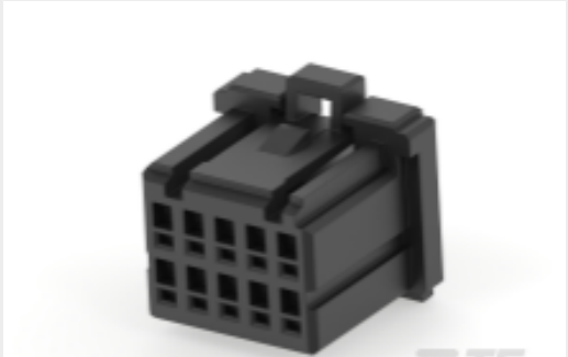
TE Part #CAT-D9934-A15A DYNAMIC 1100 REC AND TAB HSG