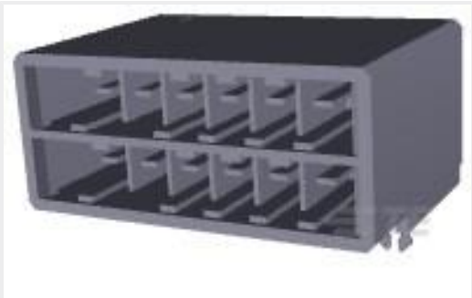
TE Part #1-316081-5 DYNAMIC D-3200 HDR ASSY 12P H