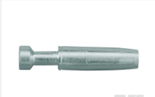
TE Part #T2030002008-000 CEF-0.75