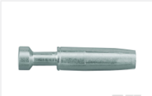
TE Part #T2030002002-000 CEF-0.3