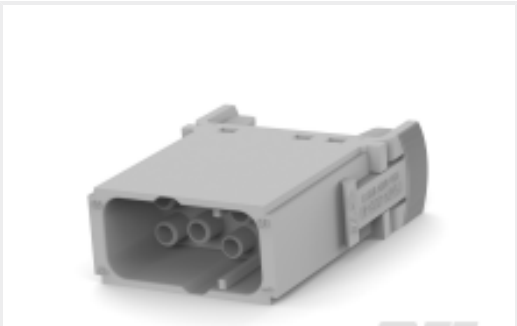
TE Part #T2111082101-000 HMN-008-M