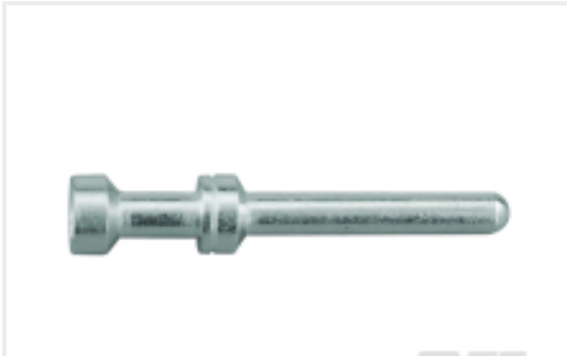
TE Part #T2030001008-000 CEM-0.75