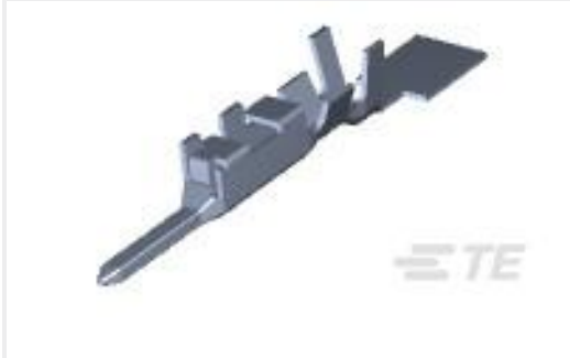
TE Part #1903120-1 DYNAMIC D1000 TAB CONT TIN (M) REEL