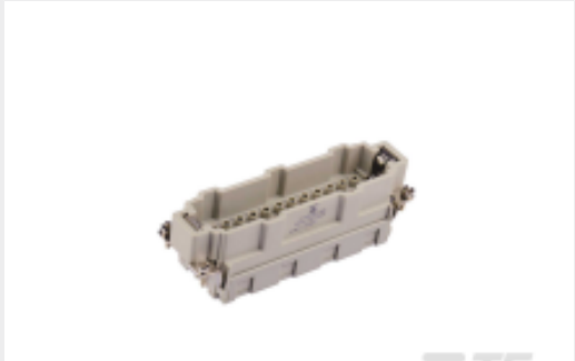
TE Part #T2040244101-000 HE-024-MC