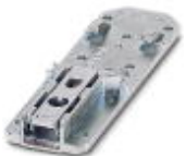
Universal DIN rail adapter

Assembly adapters - UTA 107/30 - 2320089