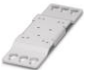
Universal wall adapter for securely mounting the power supply in the event of strong vibrations. The power supply is screwed directly onto the mounting surface. The universal wall adapter is attached at the top/bottom.

Assembly adapters - UWA 182/52 - 2938235